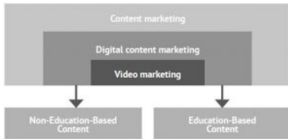
Figure 2: Content analysis model

content focus of video marketing will be examined separately according to its character, i.e. (1) non-education-based content and (2) education-based content (typically advertising) – see Fig. 2.